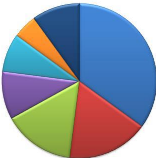
Market share in the UK supermarket industry

The pie chart below shows what % of the market the 6 biggest UK supermarket chains control. Use your existing knowledge of the industry to try and identify which segment of the chart represents which supermarket chain. 10% of the chart can just be labelled 'other'.