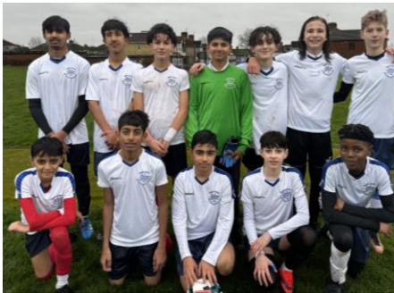
Congratulations to the Football team, keep up the hard work!

I am proud of our year group fostering community around the school and giving opportunities for positive interactions. Giving your time and energy to others builds them as people, this can only benefit everyone.