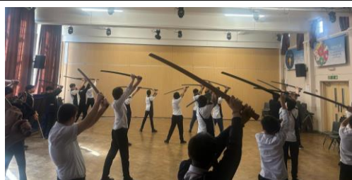
Our students enjoying stage combat last week!

This week you will be making a crucial decision about your futures. A new link will be sent out today for you to confirm your preference choices for your GCSEs. Make sure you are making an informed choice and have discussed carefully with your parents and guardians. The deadline for submission is 5pm on Thursday the 27 th of March. If you miss the deadline, you risk missing your preferred subjects. Celebration assembly is this week! We look forward to celebrating your successes and growth with your parents and guardians on Wednesday the 26 th of March.