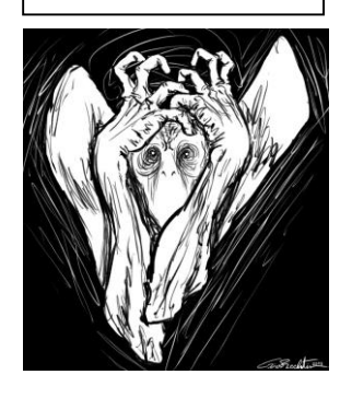
Option 2 - Create a painting/mixed media piece that represents one of the five senses