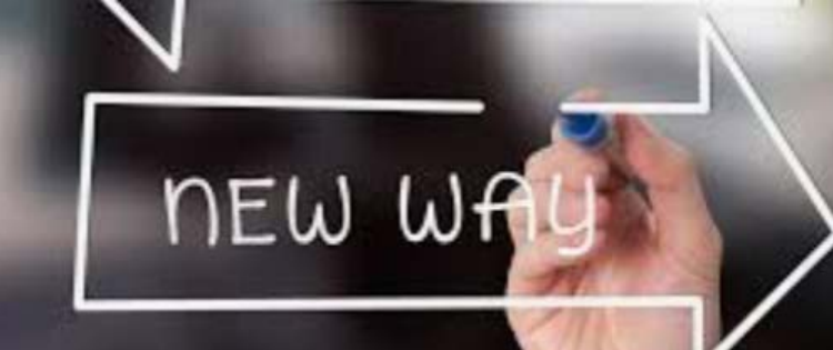
Being able to predict and adapt to changes in working in all areas.